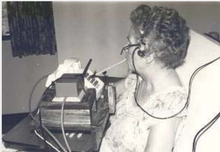
Adapted telephone 1960s.

With a shift in the profession's practice, a time of adaptive equipment and technologies began to emerge. As technology became more sophisticated, the creativity and ingenuity of occupational therapists would grow to meet many challenges. Just looking at older forms of adaptive equipment can remind us of how inventive and accommodating occupational therapists were required to be.